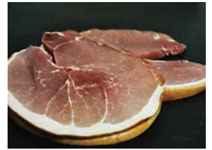
Smoked Gammon Slices