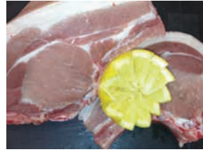
Saddleback Pork Chops 2 x chops 600g £5.70 4 x chops 1.2kg £11.40