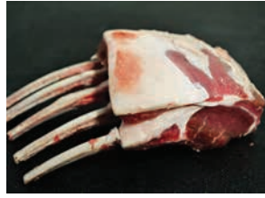
French Trimmer Lamb Cutlets 2 x chops 150g £3.10