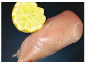
Barn Reared Chicken Fillets 2 x 226g approx £4.95 4 x 226g approx £9.90