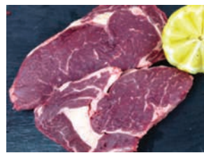
Rib-eye Steak 2 x steaks 500g £16.25 4 x steaks 1kg £32.50