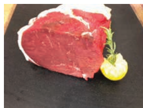
Corner Cut 1kg £11.45