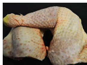
Free Range Chicken Legs 800g, approx 4 legs £5.35