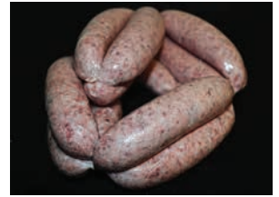
Saddleback Foxholes Special Pork Sausages