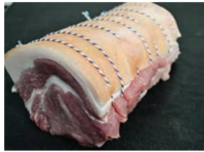
Chinese Pork Loin