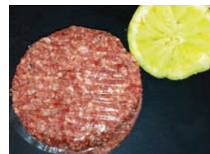
Foxholes Beef Burgers 4 x burgers, 500g £5.40 8 x burgers, 1kg £10.80 12 x burgers, 1.5kg £16.20