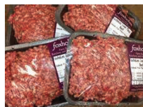
Minced Beef 500g £4.15