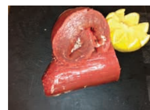
Beef Skirt 500g £5.50 1kg £10.95 1.5kg £16.45