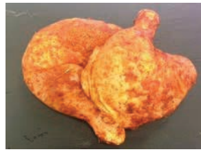
Cajun Chicken Legs 1kg, 4 legs £7.30