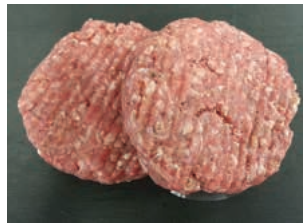
Veal Burgers Pack of 4, 500g £4.90 Pack of 8, 1kg £9.80 Pack of 12, 1.5kg £14.70