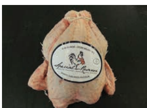
Free Range Whole Chicken approx 1.3kg-1.5kg £8.95