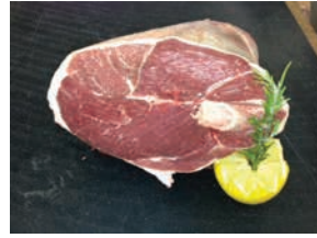
Leg of Lamb Half Leg £20.95 Whole leg £41.85