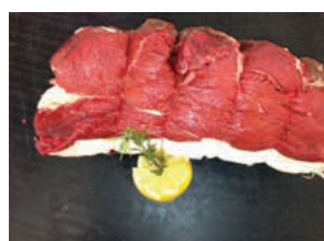
Rump Joint 1kg £21.95 1.5kg £32.95 2kg £43.90