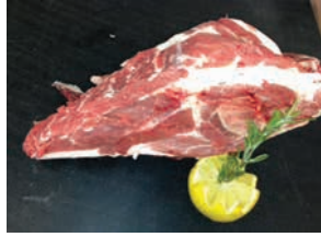
Shoulder of Lamb Half Shoulder £14.85 Whole shoulder £24.75