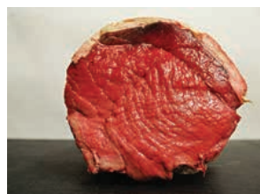
Topside 1kg £13.50 1.5kg £16.45 2kg £21.90