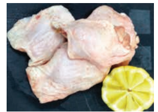
Barn Reared Chicken Thighs 700g, 4 thighs £4.40