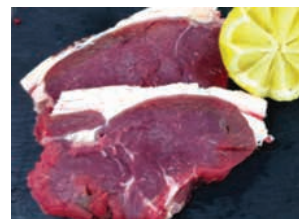
Sirlion Steak 2 x steaks 500g £15.00 4 x steaks 1kg £29.95