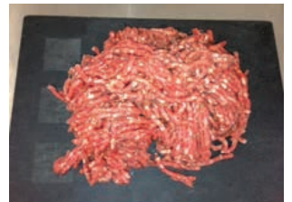
Minced Veal Approx 1kg £9.45