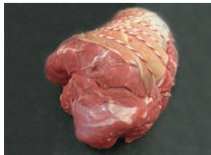
Veal Roasting Joint 1kg £16.30 1.5kg £24.45 2kg £32.60