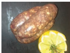
Traditional Beef Sausages 5-6 sausages, 400g £3.90