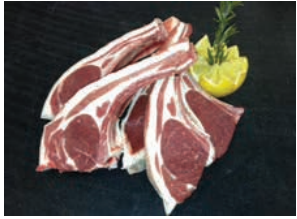
Lamb Cutlets 2 x cutlets 250g £4.65 5 x cutlets 500g £9.30 6 x cutlets 750g £13.95