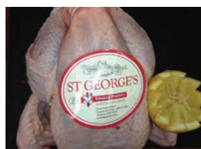
Barn Reared Whole Chickens approx 1.7kg £8.25