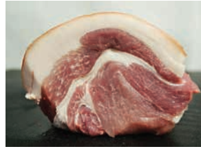
Saddleback Boneless Pork Loin 1kg £12.45