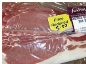
Unsmoked Dry Cure Back Bacon