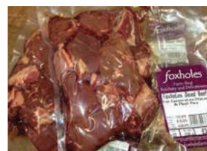
Diced Beef 500g £5.00