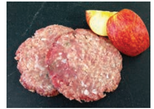
Pork & Apple Burgers