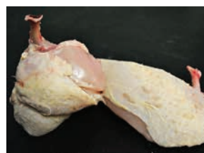
Free Range Chicken Supreme 2 x 200g supremes £4.20