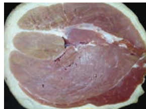
Unsmoked Gammon Slices