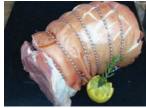
Saddleback Boneless Leg of Pork 1kg £10.15 1.5kg £15.20 2kg £20.30