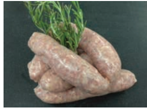
Willows Pork Sausages