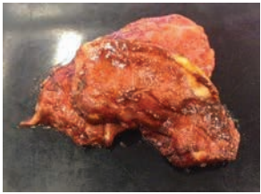
Chinese Pork Chops