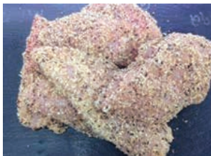
Lemon Pepper Chicken Fillets 2 fillets £5.40