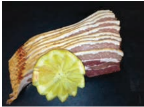
Smoked Streaky Bacon 250g, 8 slices £2.75