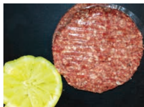
Beef Burgers 4 x burgers, 500g £5.00