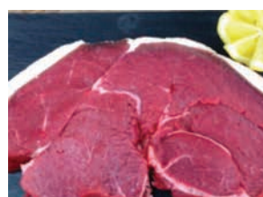
Rump Steak 2 x Steaks 500g £11.00 4 x steaks 1kg £21.95