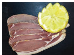
Smoked Dry Cure Back Bacon