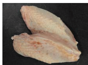
Free Range Chicken Fillet 2 x 200g £4.80 4 x 200g £9.60