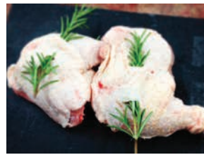
Barn Reared Chicken Legs 1kg, 4 legs £6.30