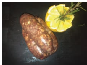
Beef Sausages with Horseradish 5-6 sausages, 400g £3.90