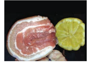
Saddleback Pork Belly 1kg £8.85 1.5kg £13.30 2kg £17.70