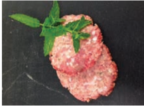
Minted Lamb Burgers Approx 350g, 4 burgers £4.50