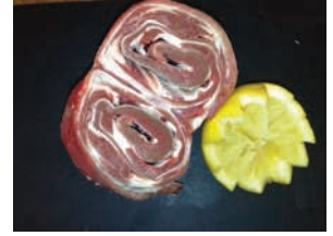
Lamb Breast x1 £5.00