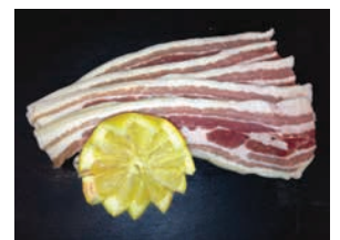
Unsmoked Streaky Bacon