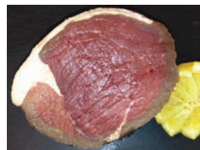
Silverside 1kg £10.60 1.5kg £15.90 2kg £21.20