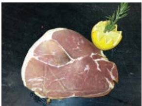
Unsmoked Gammon Joint