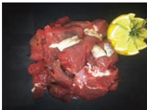
Diced Veal Approx 1kg £9.00