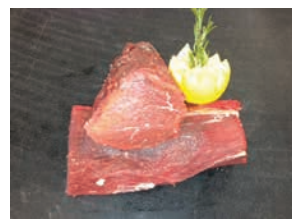
Fillet Joint 1kg £42.00 1.5kg £63.00 2kg £84.00