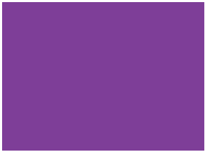
Pork & Apple Sausages