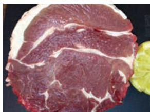
Rolled Rib/ Boneless 1kg £19.95 1.5kg £29.90 2kg £39.90