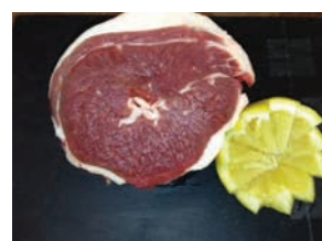
Brisket 1kg £8.95 1.5kg £13.40 2kg £18.00