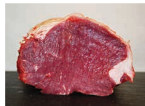
Sirlion Joint 1kg £26.50 1.5kg £39.75 2kg £53.00