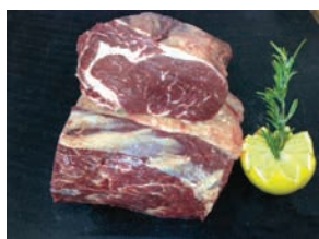
Rib-eye Joint 1kg £32.50 1.5kg £48.75 2kg £65.00