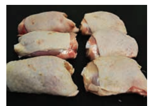
Free Range Chicken Thighs approx 550g, 4 thighs £3.60